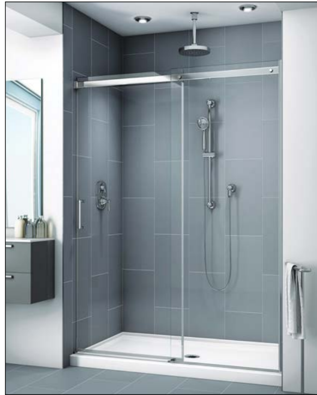
Apollo Inline Door with Fixed Panel 6mm, Sekur+ Glass, 57"-60" W x 75" H