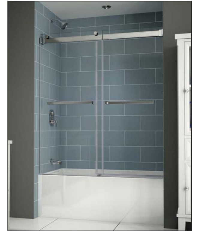
Gemini Plus Tub Door 10mm, Sekur+ Glass, 60" W x 66" H

Chrome FLNPS160-11-40 $1,116.46 Brushed Nickel FLNPS160-25-40 $1,137.07