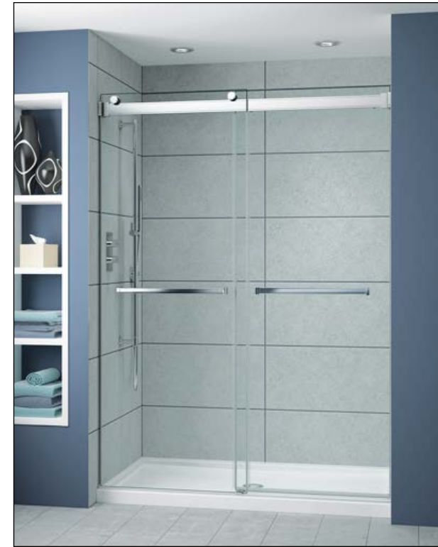
Gemini Plus Inline Door with Bypass 10mm, Sekur+ Glass, 60" W x 79" H

Brushed Nickel FLNAS60-25-40L (Left) FLNAS60-25-40R (Right) $968.75