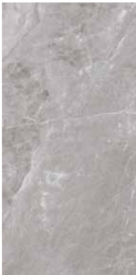
04MARGRA1224 (matte) 04MARGRA1224P (polished)