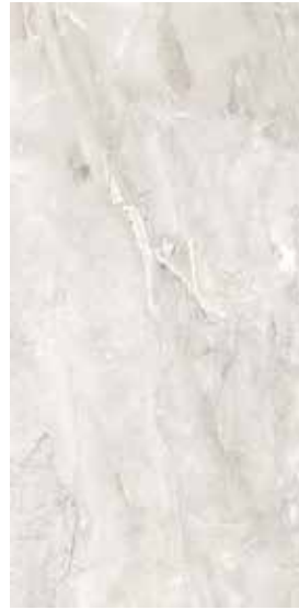
04MARIVO1224 (matte) 04MARIVO1224P (polished)