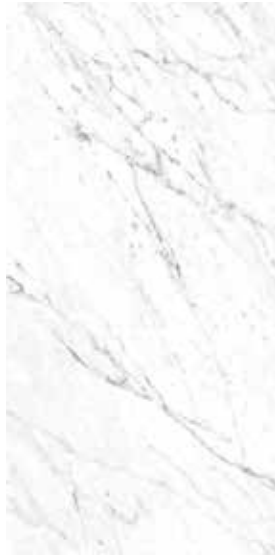
04MARCAR1224 (matte) 04MARCAR1224P (polished)