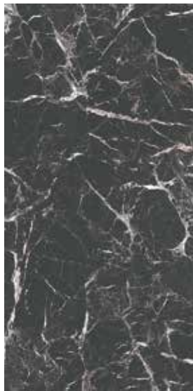
04MARMAR1224 (matte) 04MARMAR1224P (polished)