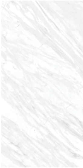
04MARVOL1224 (matte) 04MARVOL1224P (polished)