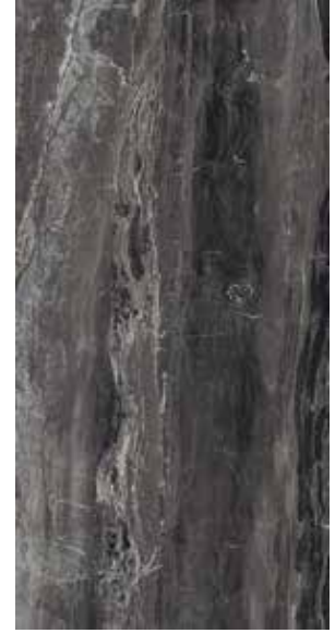
04BRENOI1224 (matte) 04BRENOI1224P (polished)