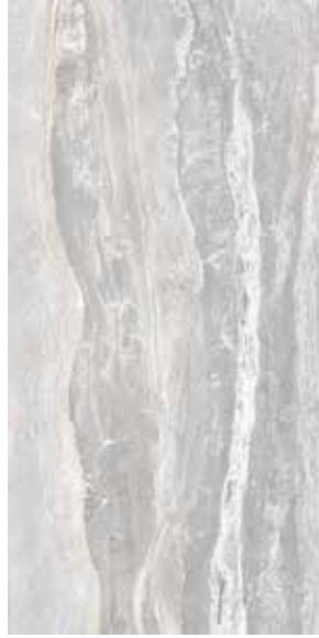
04BRESIL1224 (matte) 04BRESIL1224P (polished)