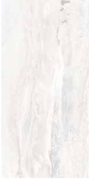
04BREWHI1224 (matte) 04BREWHI1224P (polished)