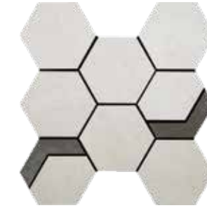
NVM01 Hex with Iron