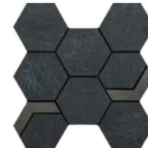
NVM05 Hex with Iron