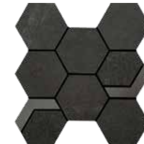
NVM06 Hex with Iron