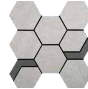
NVM02 Hex with Iron