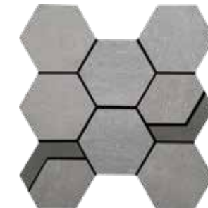
NVM03 Hex with Iron