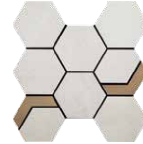
NVM01 Hex with Gold