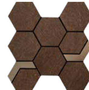
NVM04 Hex with Gold Available with Iron