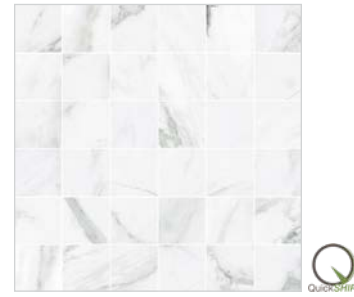
2x2 Mosaic (matte)