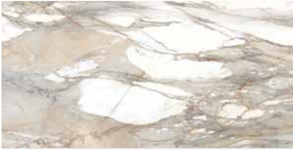
75CLACRE1224 (matte) 75CLACRE1224P (polished)