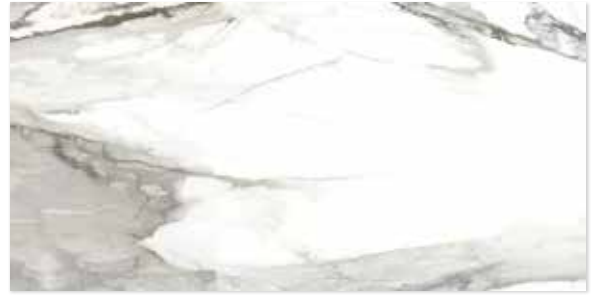
75CLAGRI1224 (matte) 75CLAGRI1224P (polished)