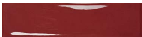
45VIVMAG310G (glossy) 45VIVMAG310 (matte)