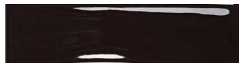
45VIVNOI310G (glossy) 45VIVNOI310 (matte)