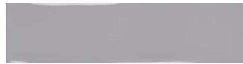
45VIVFUM310G (glossy) 45VIVFUM310 (matte)