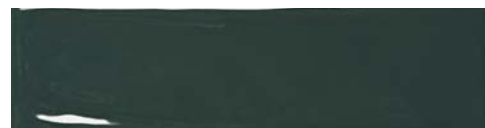
45VIVPIN310G (glossy) 45VIVPIN310 (matte)