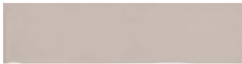
45VIVBRU310G (glossy) 45VIVBRU310 (matte)