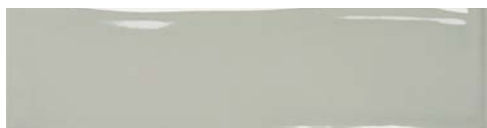
45VIVSAU310G (glossy) 45VIVSAU310 (matte)