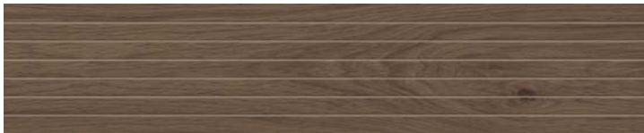
Spa (available in all colors)