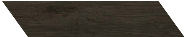
Chevron (available in all colors)