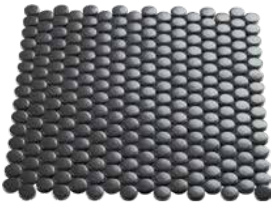
03MTP0334PG (gloss) 03MTP0334PM (matte)