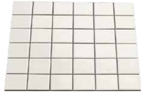
03MTP012MG (gloss) 03MTP012MM (matte)