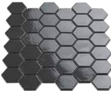
03MTP032HG (gloss) 03MTP032HM (matte)