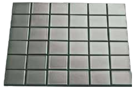
03MTP022MG (gloss) 03MTP022MM (matte)