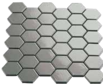
03MTP022HG (gloss) 03MTP022HM (matte)