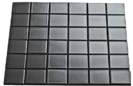
03MTP032MG (gloss) 03MTP032MM (matte)