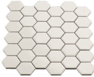
03MTP012HG (gloss) 03MTP012HM (matte)