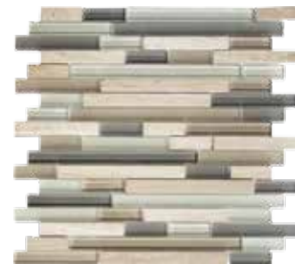
Beach Linear 53ELEBEA12LM