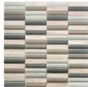
1/2x3 Beach Stacked 53ELEBEA123M Available in this color only