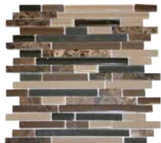
Branch Linear 53ELEBRA12LM