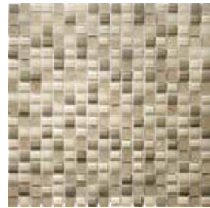
1/2" Meriweather 53ELEMER12M