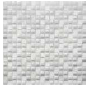
1/2" Polar 53ELEPOL12M