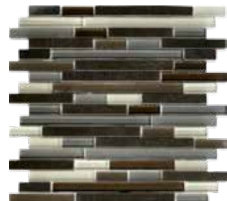
Twilight Linear 53ELETWI12LM