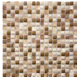
1/2" Stone 53ELESTO12M