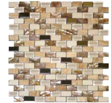
Travertine Brick with Mother of Pearl and Stainless and Glass 53MELTRA12