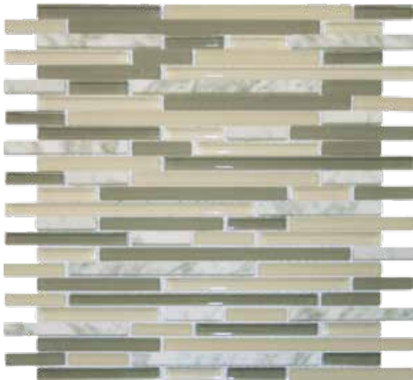
Calm Blend 53RESCAL12M (Coordinates with Calacatta Marble)