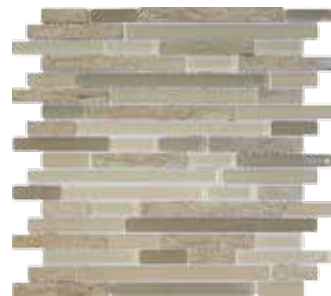
Meriweather Linear 53ELEMER12LM