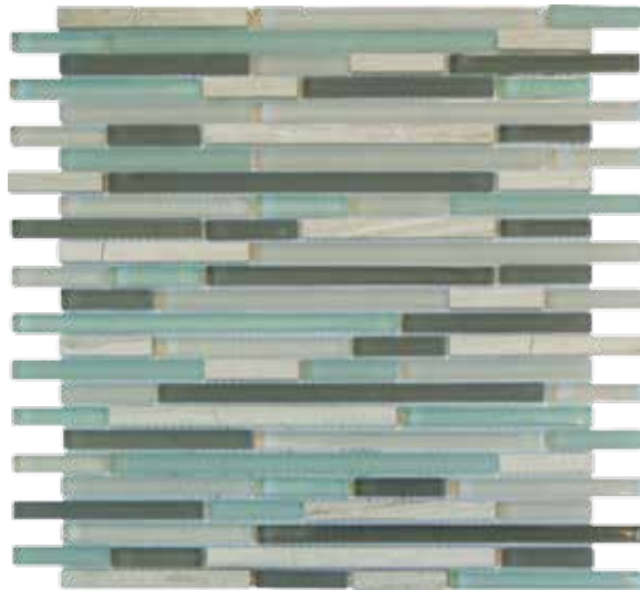
Relax Blend 53RESREL12M (Coordinates with Wooden White Marble)