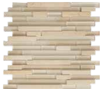
Cosmos Linear 53ELECOS12LM