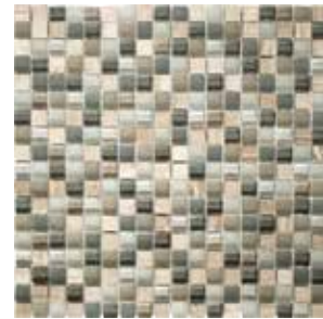
1/2" Beach 53ELEBEA12M