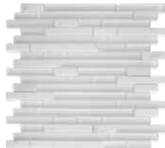
Polar Linear 53ELEPOL12LM