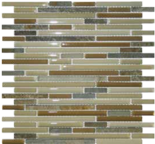
Camel 53STICAM12L (Glass and Chinese Multicolor Slate)