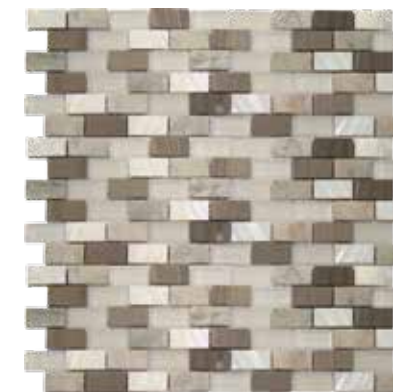
Athens Gray and Gray Cloud Marble Brick with Mother of Pearl and Super White Glass 53MELATH12