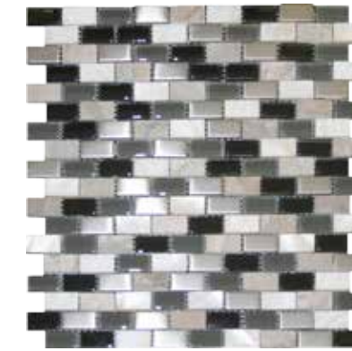
Gray Cloud Marble Brick with Mother of Pearl, Stainless and Black Glass 53MELGRA12