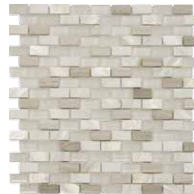
Wooden White and Arabescato Marble Brick with Mother of Pearl and Super White Glass 53MELWHI12