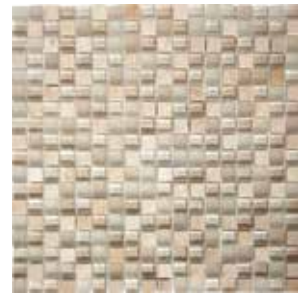
1/2" Cosmos 53ELECOS12M