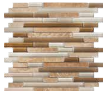
Stone Linear 53ELESTO12LM