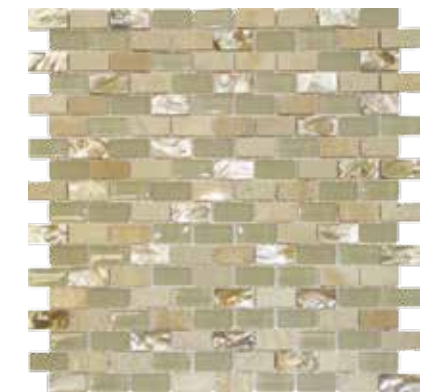
Moscato Glass and Travertine Brick with Mother of Pearl 53MELMOS12

1/2" Mosaics sold by 12" x 12" Sheets Approx. $19-20/sht