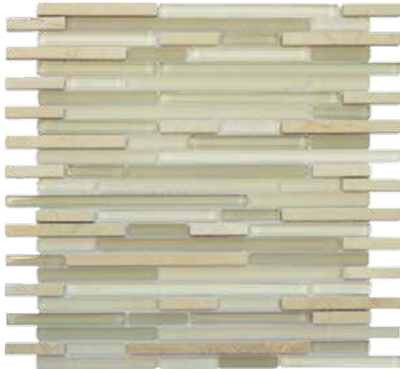
Zen Blend 53RESZEN12M (Coordinates with Crema Marfil Marble)

Mosaics sold by 12" x 12" Sheets Approx. $20/sht