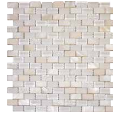
Crema Marfil Marble Brick with Mother of Pearl and Glass 53MELCRE12