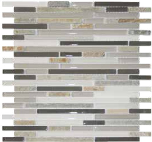
Mineral 53STIMIN12L (Glass and Golden Harvest Quartzite)