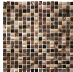
1/2" Branch 53ELEBRA12M